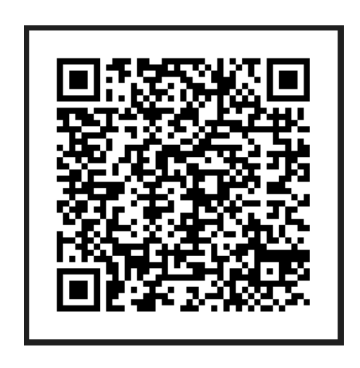
Update your NZNO or NZCCCN Membership